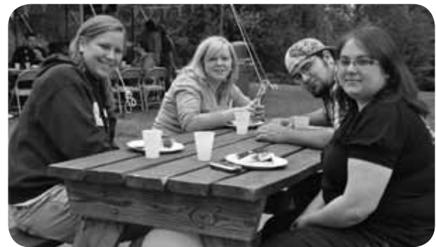
2010 New Alumni Block Party.