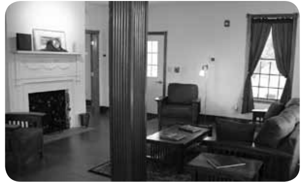
Inside the newly restored Alumni Cottage.

The CCC Foundation holds numerous fundraising events throughout the year to make such scholarships available. The Paul Titherington Memorial Golf Tournament and the Foundation Annual Raffle are among the most popular.