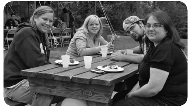
2010 New Alumni Block Party.