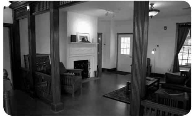
Inside the newly restored Alumni Cottage.