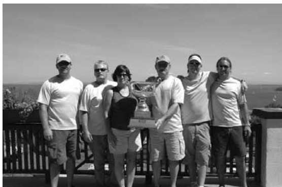
2011 Champlain Regatta Winners.